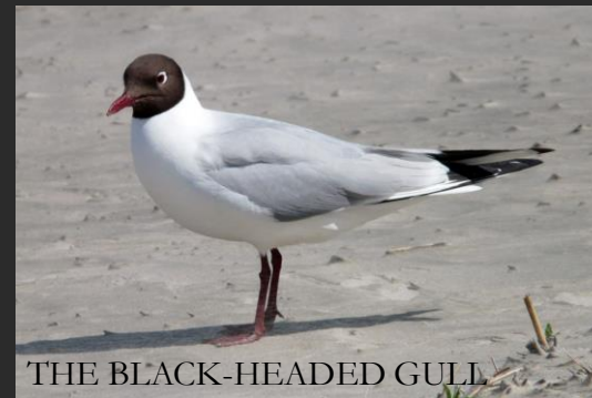
THE BLACK-HEADED GULL