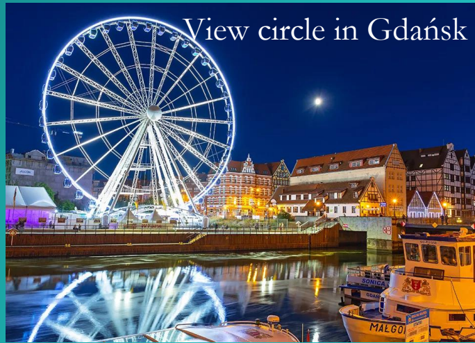
View circle in Gdańsk