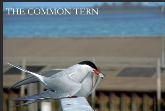
THE COMMON TERN