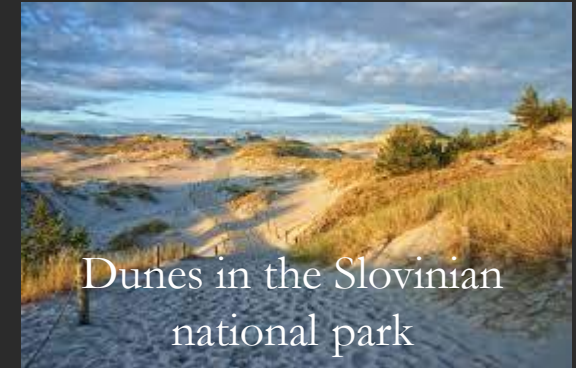
Dunes in the Slovenian national park