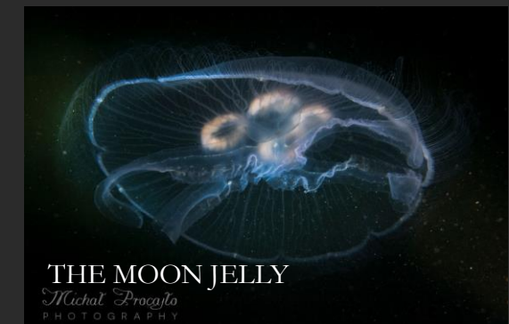
THE MOON JELLY