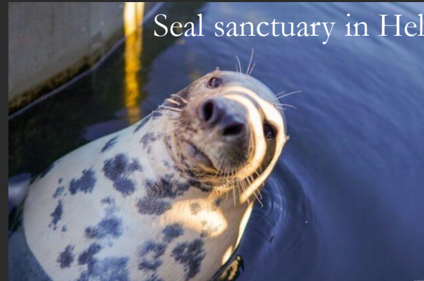
Seal sanctuary in Hel