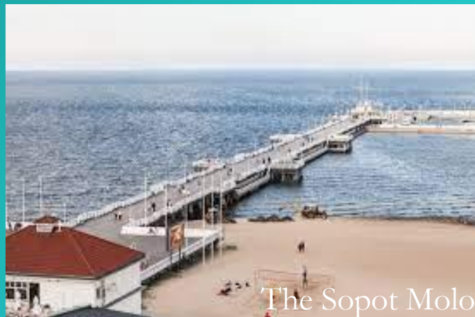
The Sopot Molo