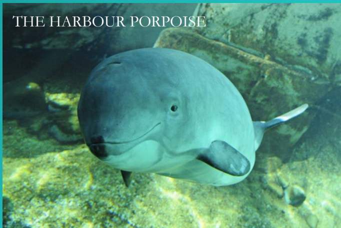
THE HARBOUR PORPOISE