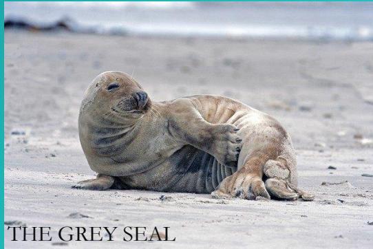
THE GREY SEAL

The animals of the Baltic Sea still represent a fairly rich species composition, although some of them are already quite seriously endangered.